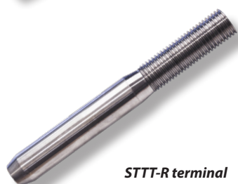
STTT-R terminal Reinforced threaded swage terminal