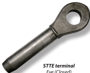
STTE terminal Eye (Closed)