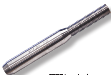
STTT terminal Threaded swage terminal